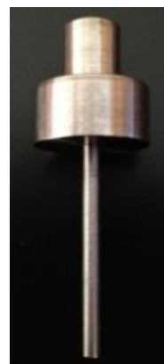
Figure 2: P-CY03S