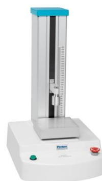
Figure 1: TVT Texture Analyzer

Both international standard methods as well as customer tailor-made profiles are available.