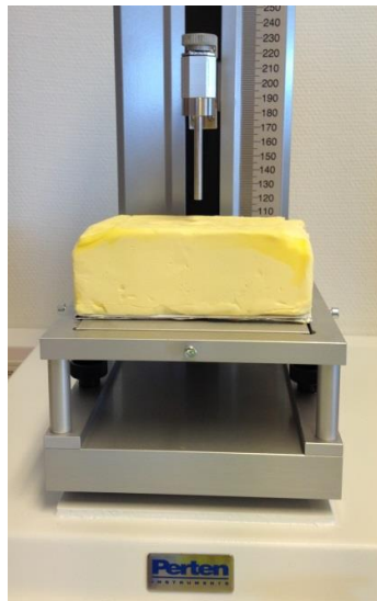
Figure 3: Sample set-up

Take the samples from their packaging just before testing and place under the probe, Figure 3. Work quickly, since the sample is sensitive for the surrounding temperature. If the same sample is used for several measurements, make sure that there is sufficient space between the penetration points. Storage, temperature and handling of the samples might influence the result and should thereby be kept constant.