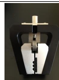
Figure 2a: R-PC