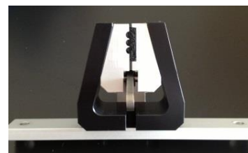
Figure 2b: R-PC

R-PC, Self-tightening Parallel Clamp, (Figure 2b)