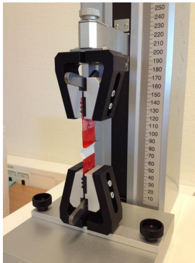
Figure 3: Sample set-up

Cut 10 cm long rectangular stripes with the sealing being in the center. Attach the sample to the rig and probe, Figure 3. Try to avoid any slack of the sample when attaching it. NOTE The extension distance should be at least twice as long as the heat-sealing.